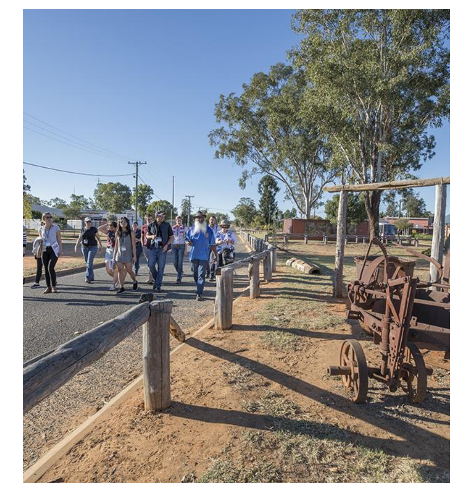
Our incredible time in Central Queensland with GROW Rural has confirmed my passion for rural health and has connected me to a group of like-minded individuals who I hope to one day call colleagues.