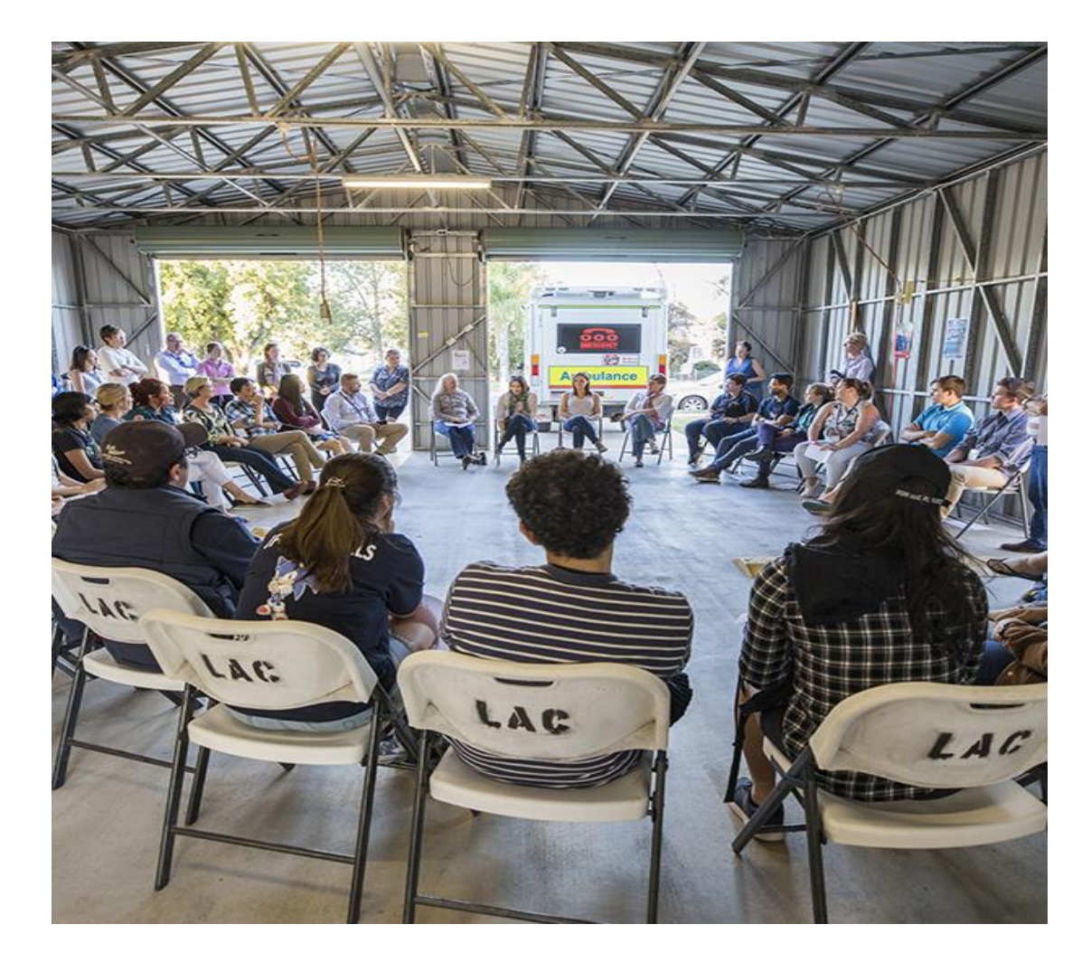
"Getting to meet and hear from health professionals in rural health practice. I really enjoyed hearing their stories and experiences"